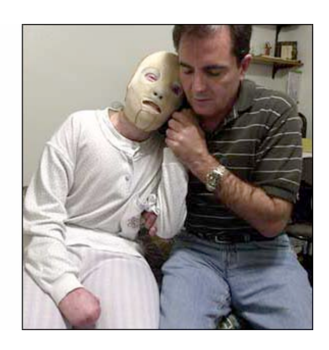
With her Father, 2000.