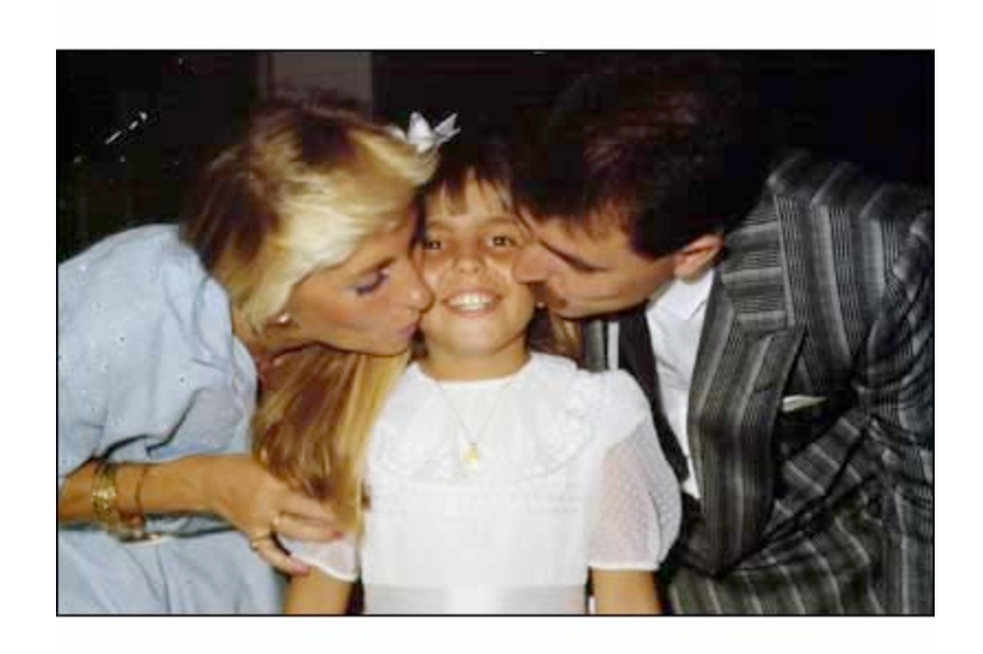
Her <u>Birthday party</u> as a child.