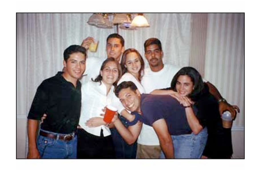
At a party with friends.